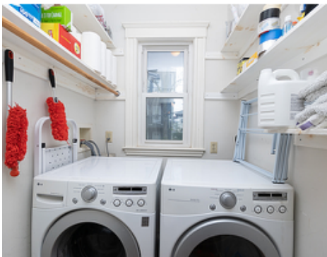
Pantry with Laundry