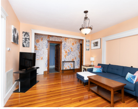
Dining Room (used as living room)