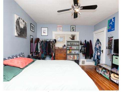
Living Room (used as 3rd bedroom)