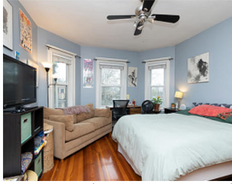
Living Room (used as 3rd bedroom)