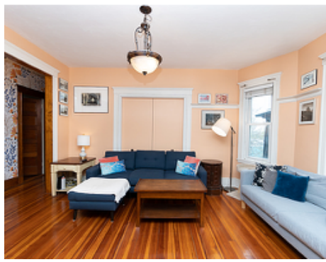
Dining Room (used as living room)