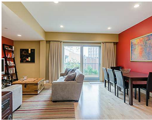
Living Dining Room