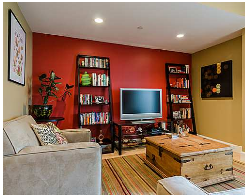
Living Dining Room