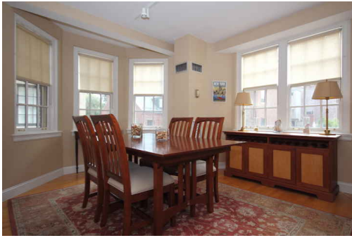
Living Dining Room