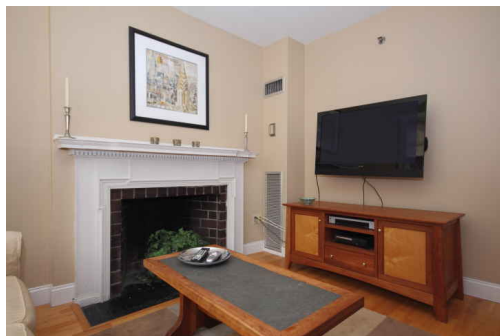
Living Dining Room