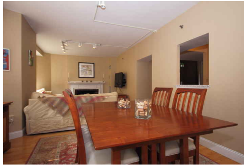
Living Dining Room