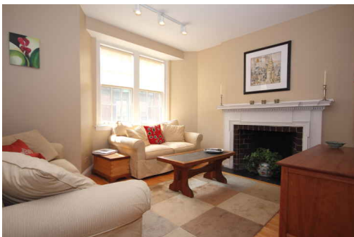
Living Dining Room