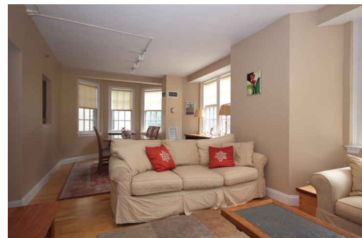
Living Dining Room