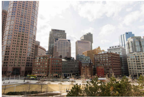
View from Balcony