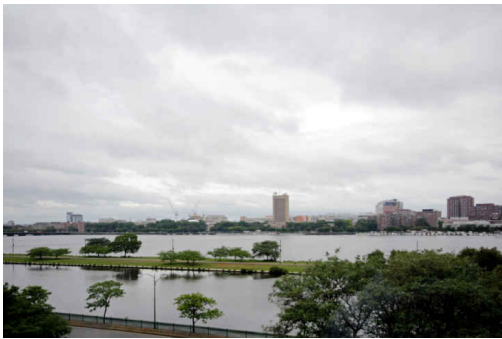
View from Living Room