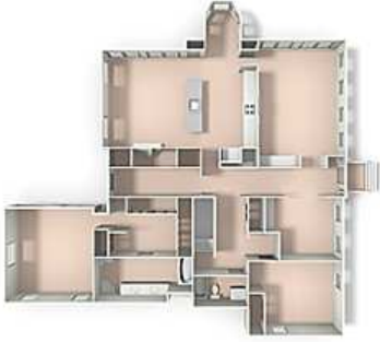
3D View - TopDown