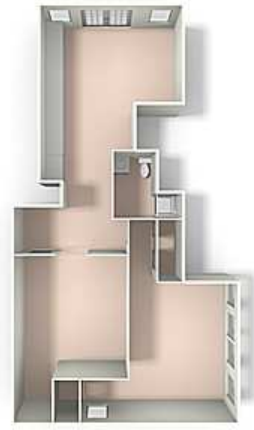
3D View - TopDown