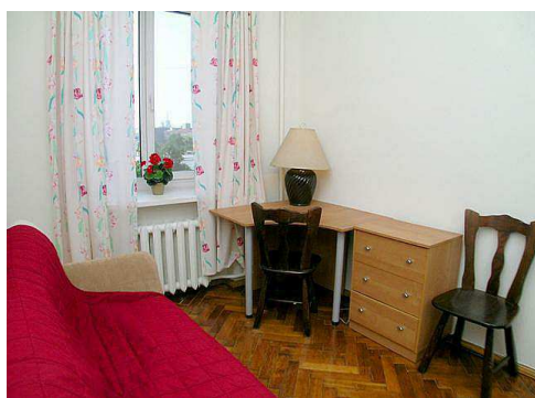
10 - Den