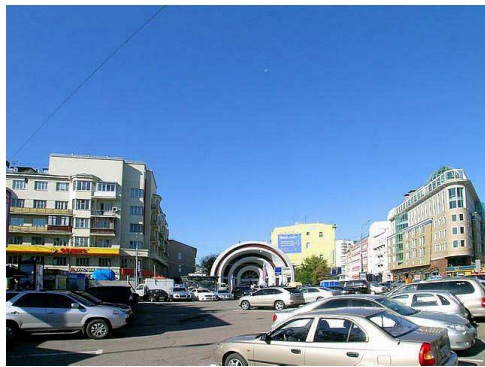
19 - Outside