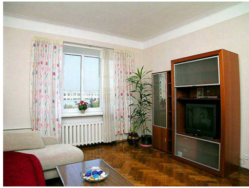
1 - Living Room