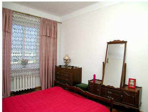
8 - Bedroom