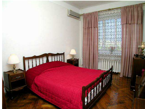
5 - Bedroom