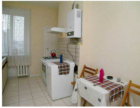
14 - Kitchen