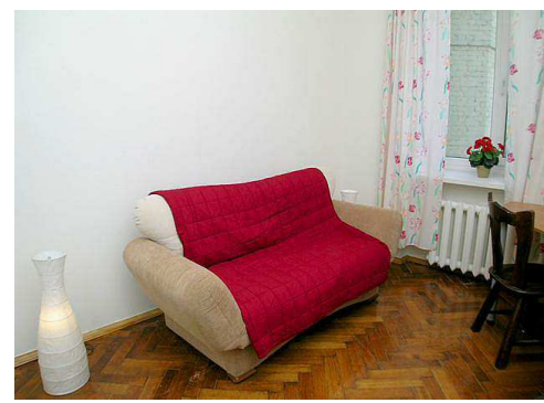
9 - Den