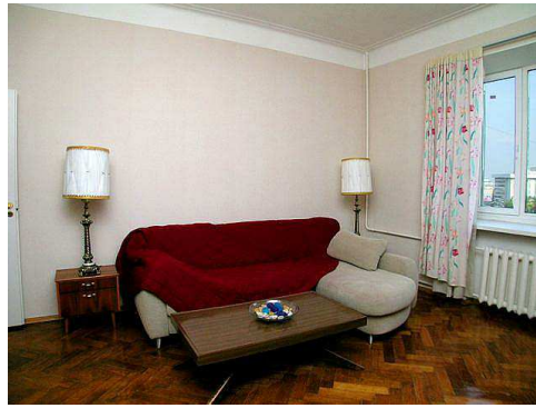
2 - Living Room