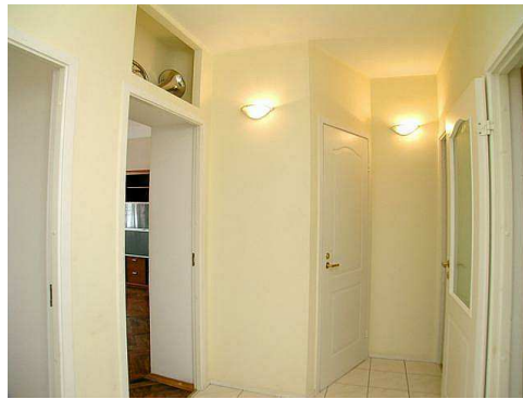
17 - Hall