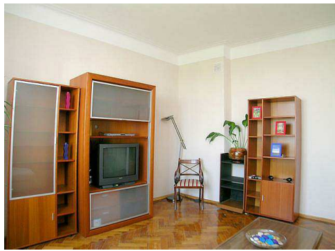
4 - Living Room