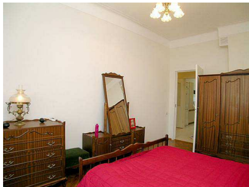
7 - Bedroom