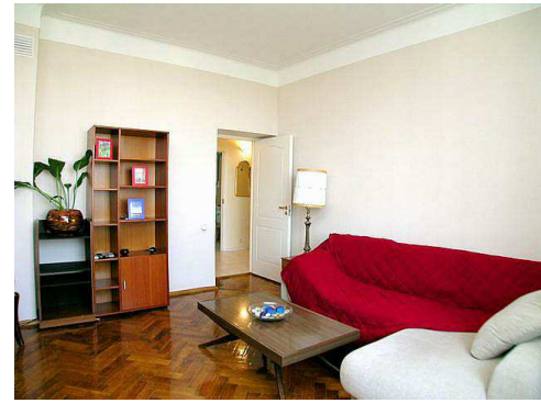
3 - Living Room