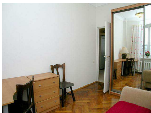
11 - Den