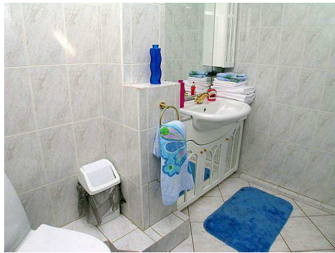
16 - Bathroom