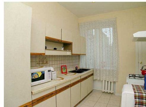
12 - Kitchen