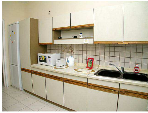
13 - Kitchen