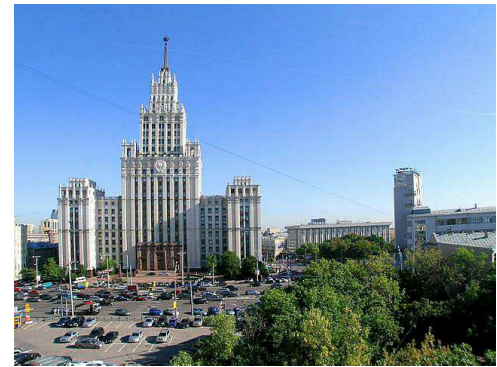
18 - Window view