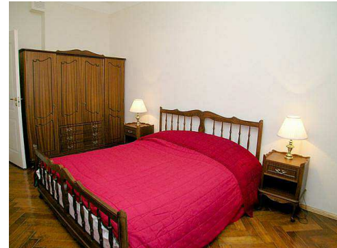
6 - Bedroom