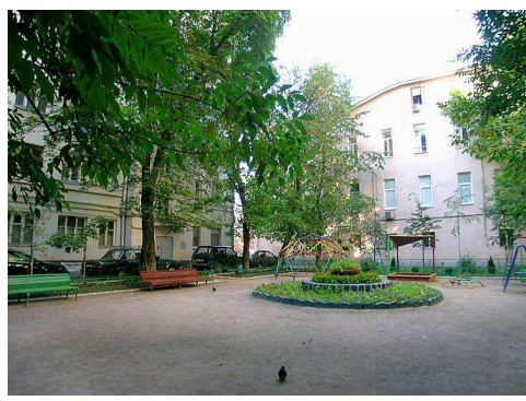
20 - Outside