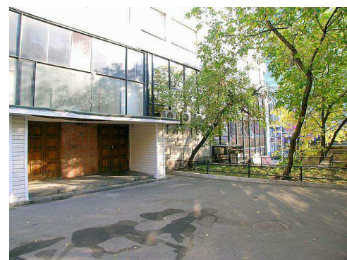
12 - Outside