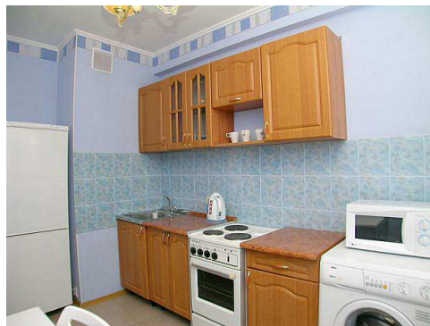
8 - Kitchen