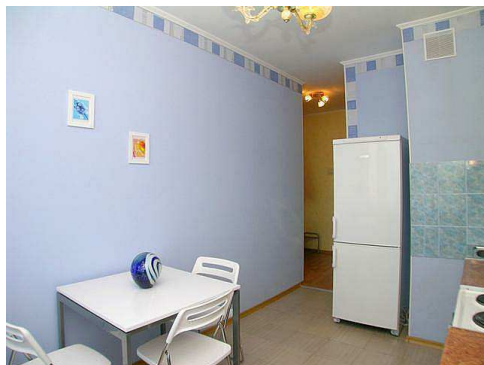
7 - Kitchen