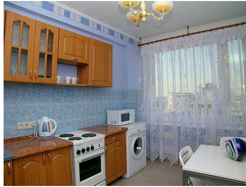
5 - Kitchen