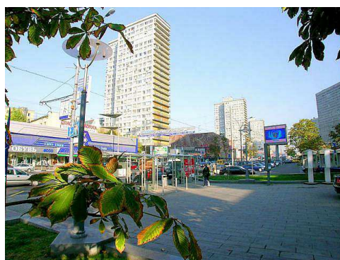
11 - Outside