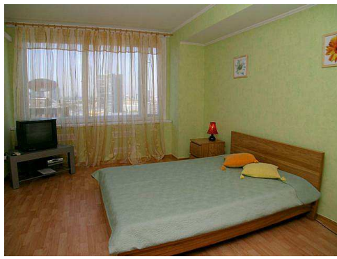
1 - Bedroom