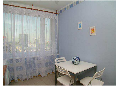
6 - Kitchen