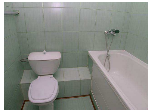
9 - Bathroom