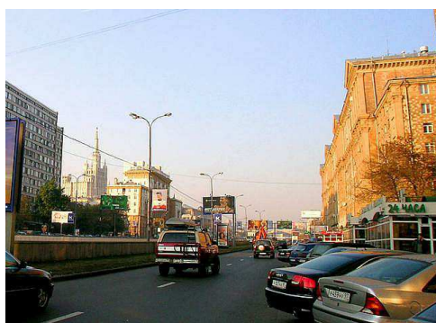
13 - Outside