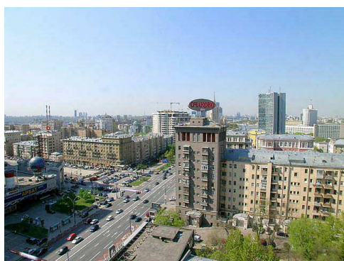
10 - Window view