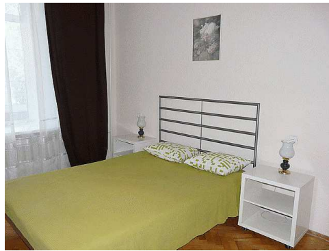
5 - Bedroom