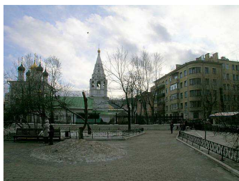
11 - Outside