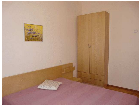
4 - Living Room