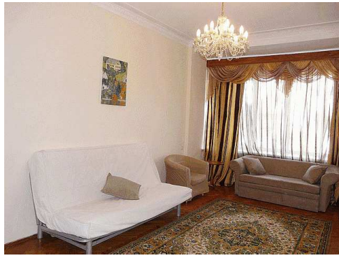
1 - Living Room