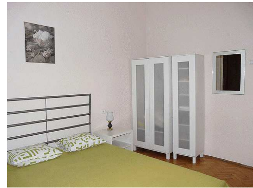
6 - Bedroom