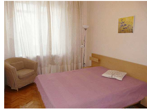
3 - Living Room