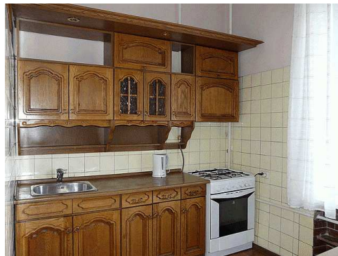
8 - Kitchen