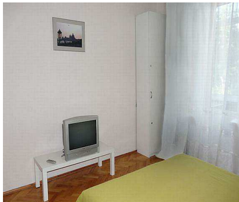
7 - Bedroom