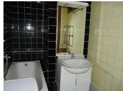
9 - Bathroom