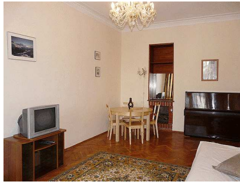
2 - Living Room