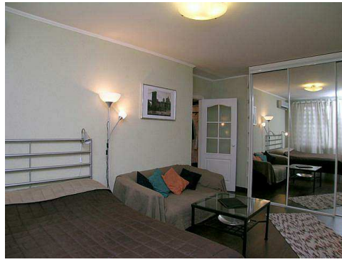
2 - Living Room