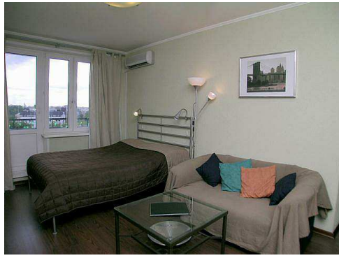
1 - Living Room