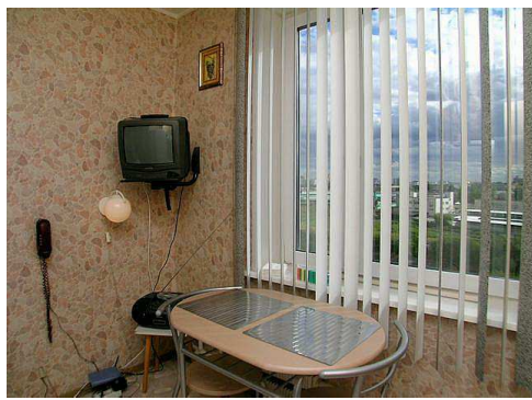
7 - Kitchen