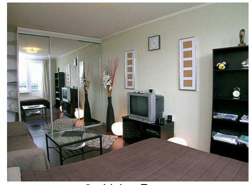
3 - Living Room