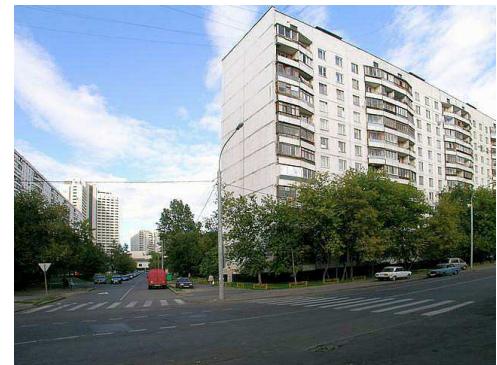
9 - Hall