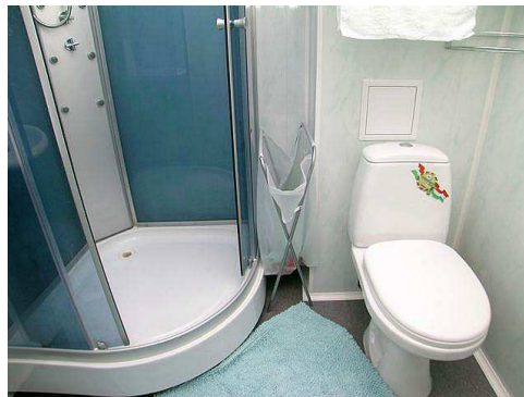
8 - Bathroom