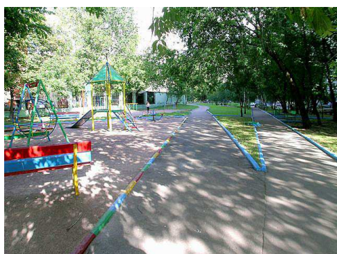
10 - Hall