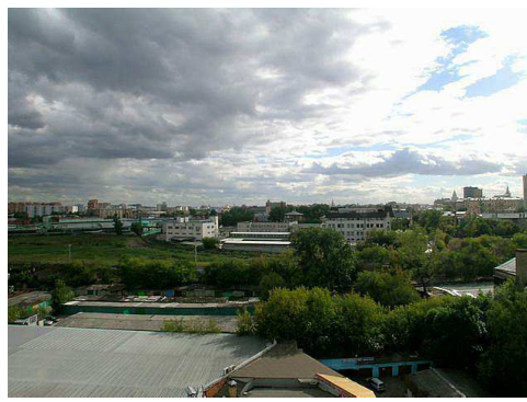
5 - Balcony view