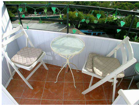
4 - Balcony