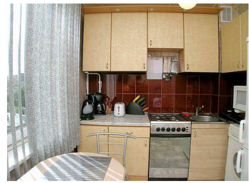
6 - Kitchen